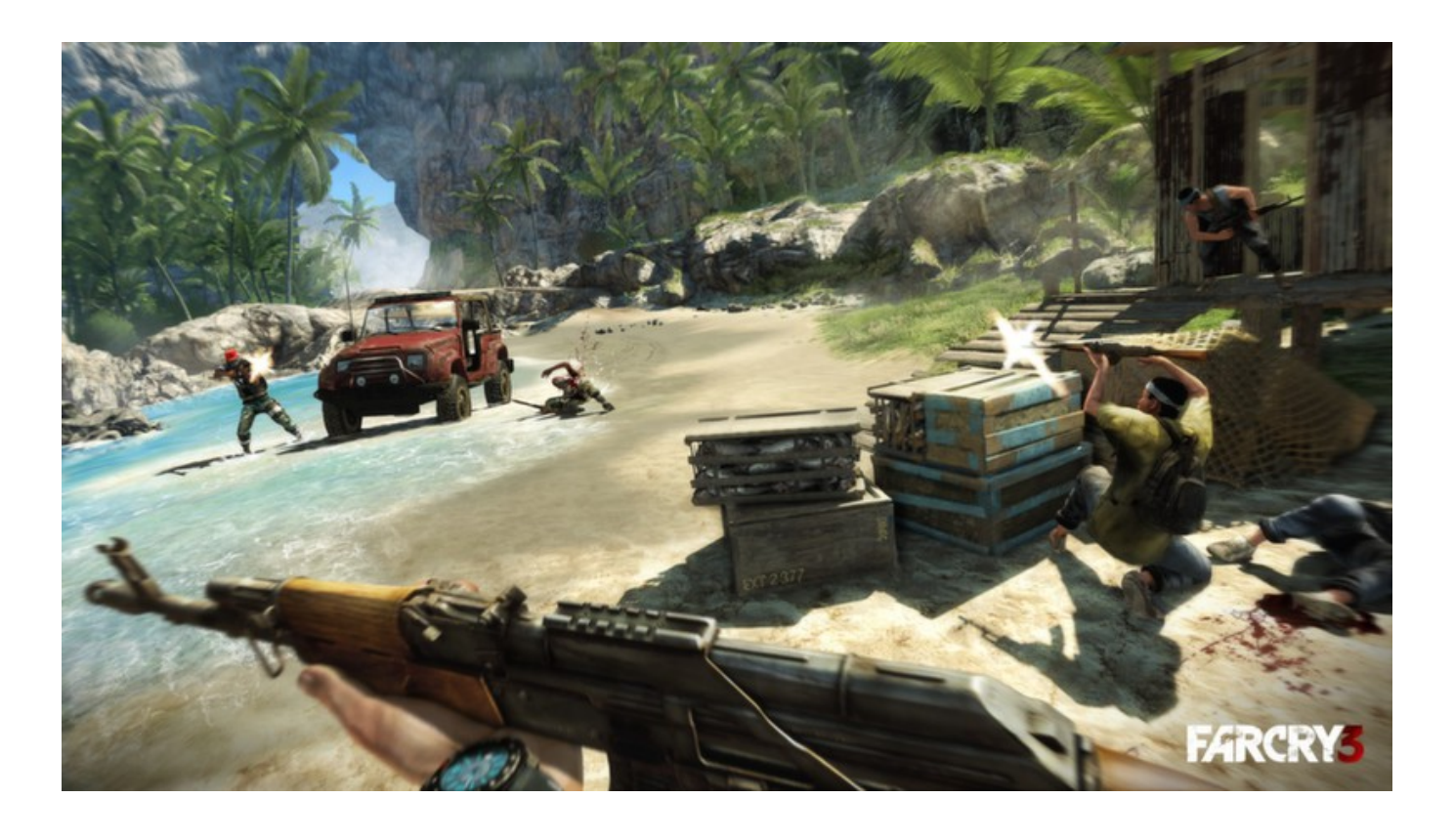
Far Cry 3 Crack Download Pc Kickass

Download ->>->> <a href="http://bit.lv/2JVoE2Z">http://bit.lv/2JVoE2Z</a>